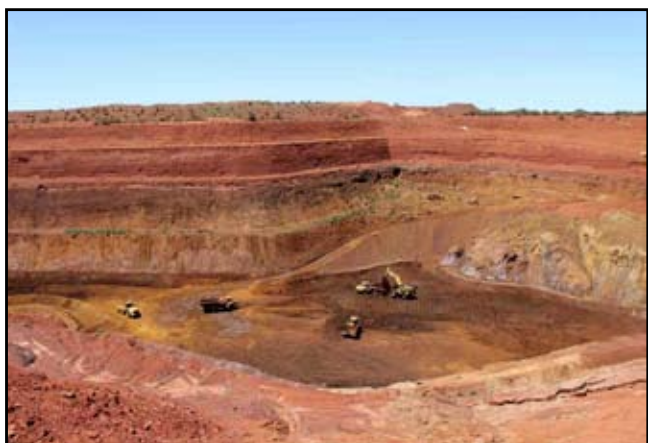
Figure 4. The open-pit REE mine at Mount Weld, already 50 metres deep into the red soils and laterites that characterise the Red Centre of Australia.

now occur mainly as monazite in with the iron oxides forming the laterite profile that lies at depths of no more than 110 metres. Production from the shallow open-pit mine started in 2012, and the ore is shipped to a processing plant in Malaysia.