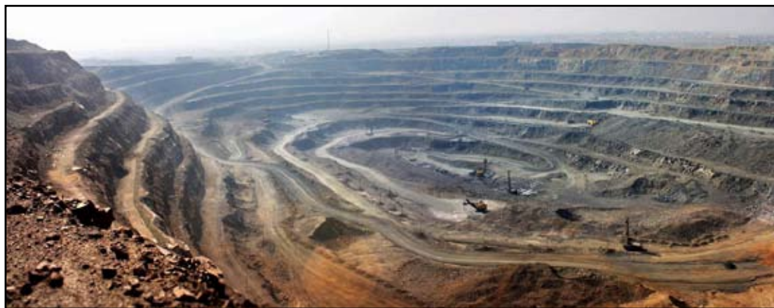
Figure 2. The huge iron ore mine at Bayan Obo, in northern China, which is also the world's major supplier of REE at the present time.

Pegmatites and skarns associated with alkaline granites are increasingly being recognised as significant resources of REE. The impact of metasomatism by late-stage fluids includes mineralised veins, breccias and disseminated ores, all with the exotic chemistry that typifies many pegmatites.