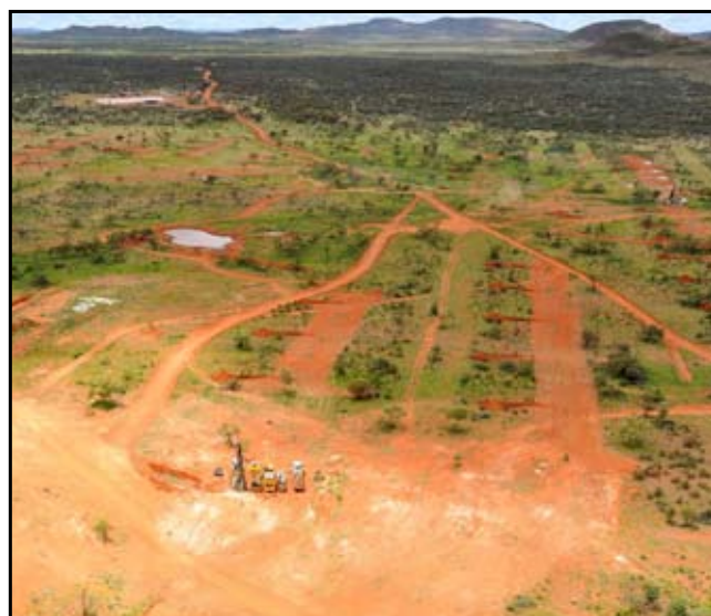
Figure 6. Progress in systematic sampling across the REE prospect at Nolans Bore in central Australia.

It is clear that the rare earth elements are not rare in geological terms. The problems in mining them come