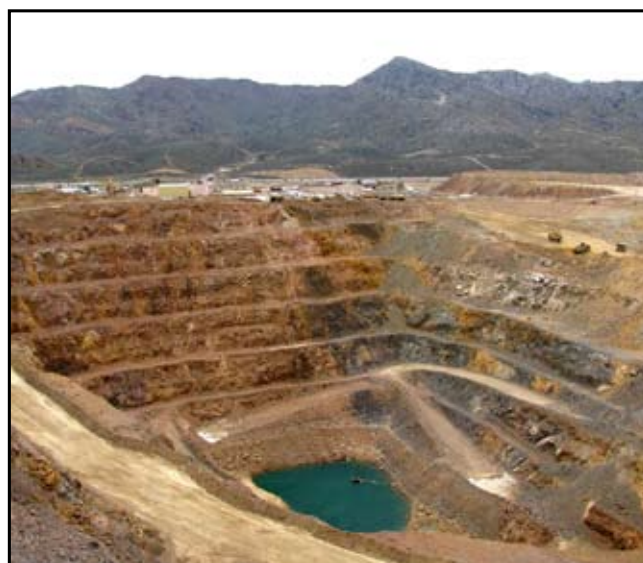
Figure 3. Little activity at the Mountain Pass REE mine that is currently under care and maintenance in California.

A newcomer now on stream is the Mount Weld mine, near Laverton, some 200 km north of Kalgoorlie in Western Australia. This is another Proterozoic carbonatite plug enriched with REE; it is 3 km in diameter and has weathered to create a cap of supergene ore with one of the world's highest grades, at 10.8 % REO through a reserve of nearly 10M t. The REE