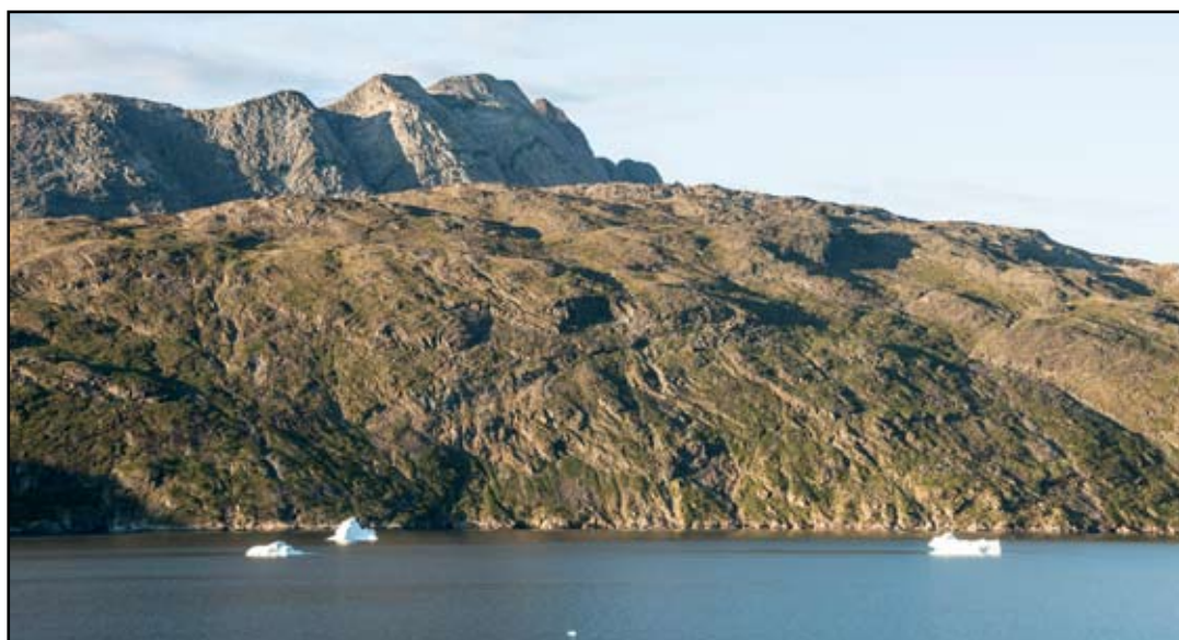
Figure 5. Small icebergs drift down a fiord cut into the Proterozoic complex of alkaline igneous rocks that contain the REE orebody at Kvanefjeld, in the southwestern corner of Greenland.

On the Laurentian Shield of eastern Canada, Strange Lake lies close to the northern part of the Labrador–Quebec border. Its alkaline granite has indicated reserves of 280M t at 0.9% REO, with higher values